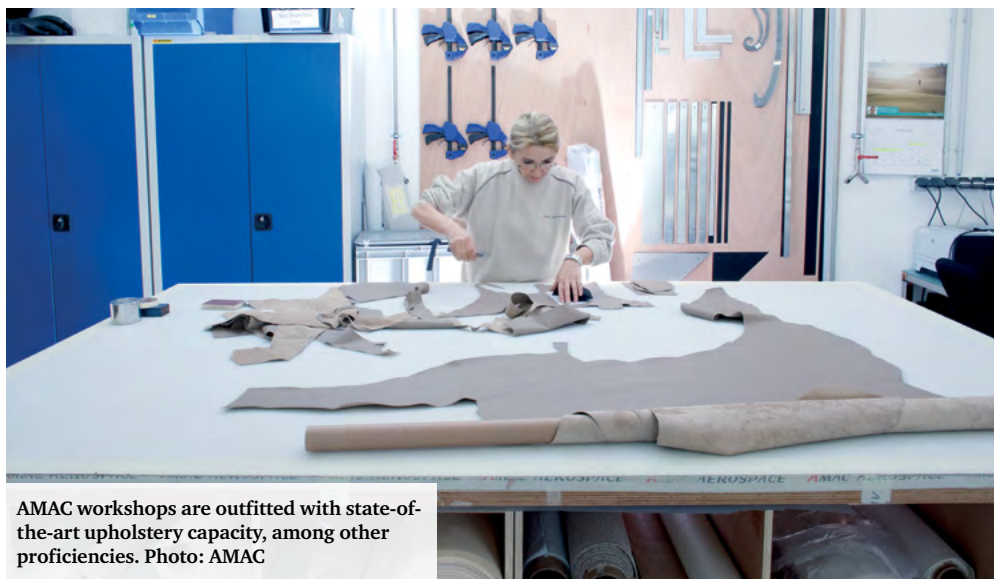
AMAC workshops are outfitted with state-of-the-art upholstery capacity, among other proficiencies.

“With carbon composite materials, the technique is different but it is something that is part of our capability, so we can work with these materials, drill holes and attach them,”