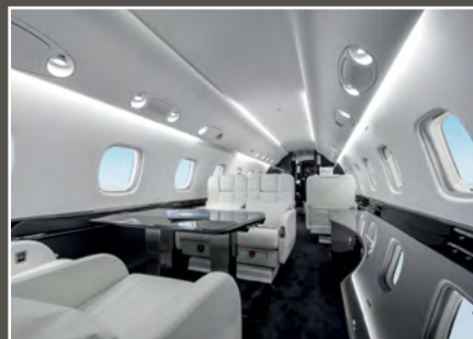
The Stahl Stay Clean lifetime+ technology protects even light coloured seats from staining.

"We are always looking for new solutions that have never been done before, so when the customer goes into the aircraft, they love it and this is our passion," adds Bauer.