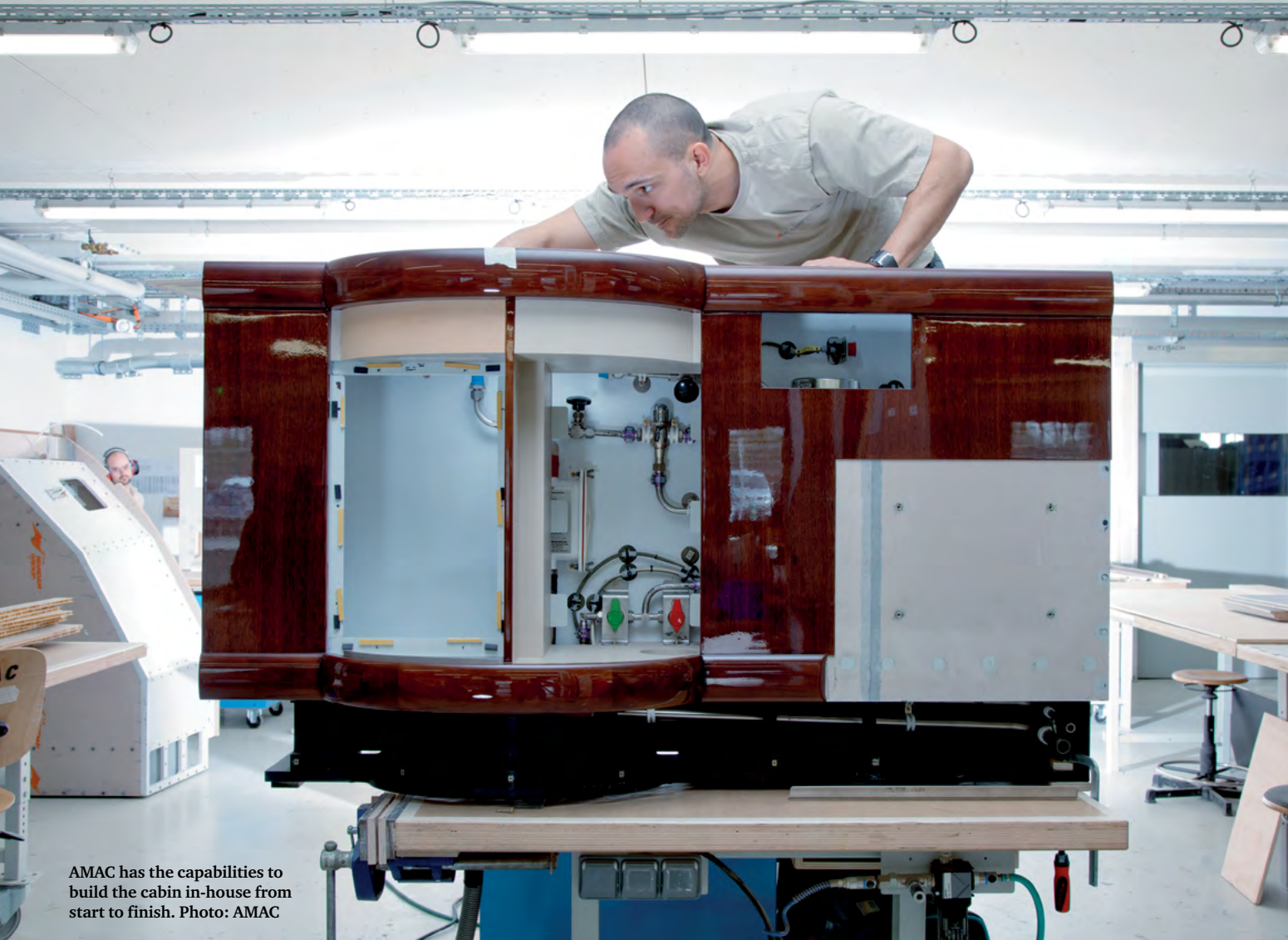
AMAC has the capabilities to build the cabin in-house from start to finish.